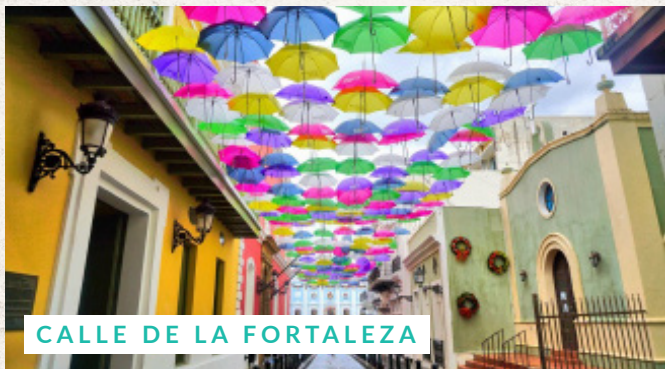
CALLE DE LA FORTALEZA